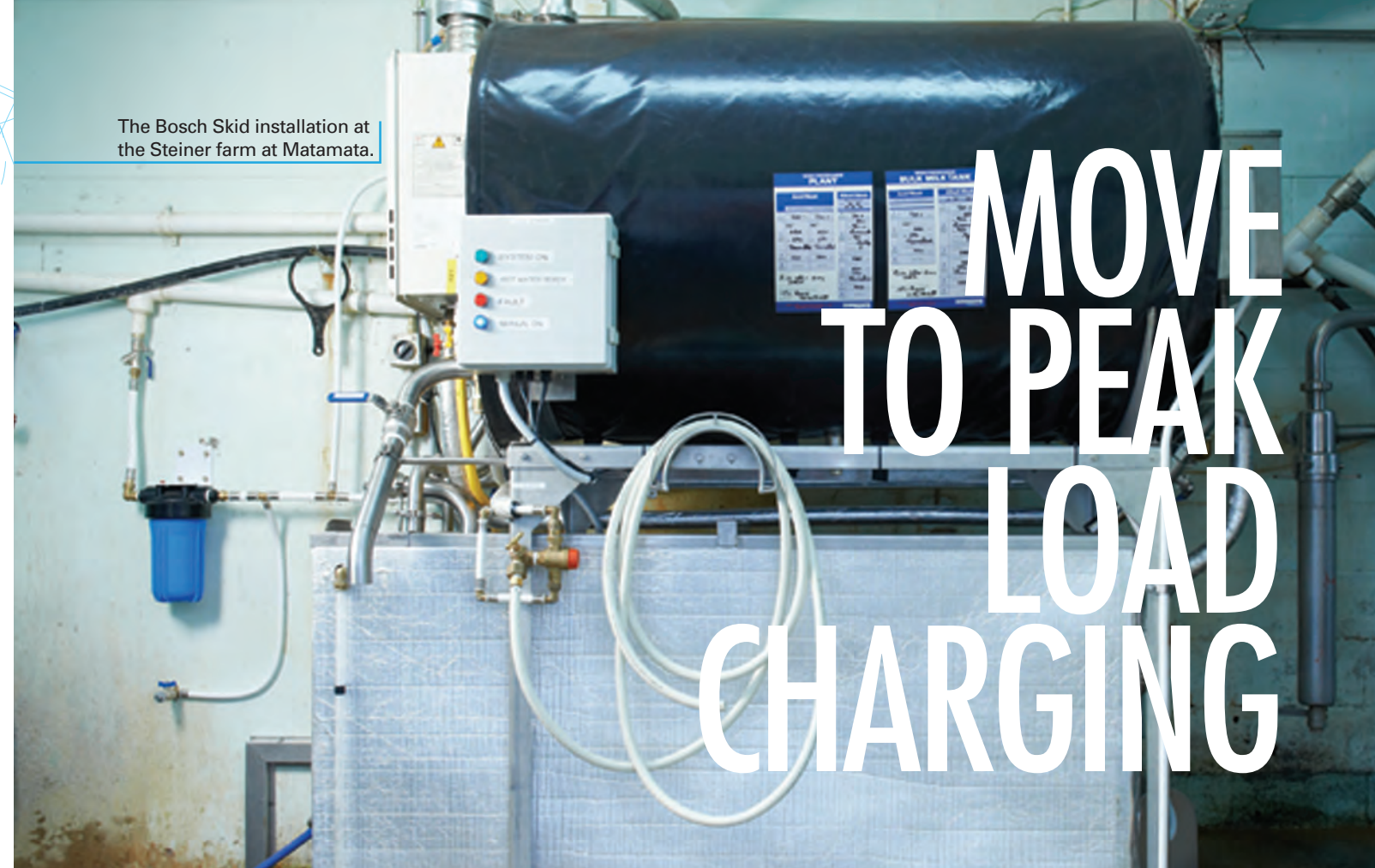
The Bosch Skid installation at the Steiner farm at Matamata.